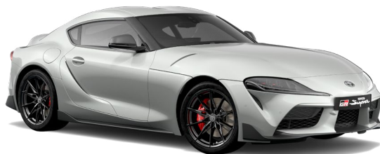
○ Fuji White 4 D01

The on-road performance of GR Supra is matched by a powerful range of colour choices. Whether you prefer bold or a subtle style, there's a perfect colour to match.