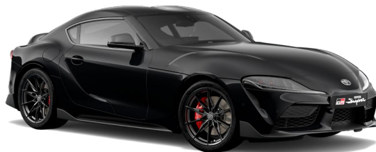
● Bathurst Black 4 D04