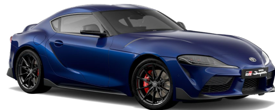
● Azure Blue 4 D13