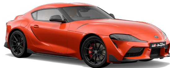
● Plazma Orange 4 D19