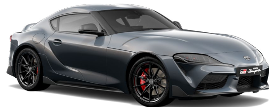
● Copper Grey 4 D14