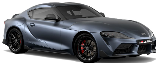
● Nurburg Matte Grey 4 D08