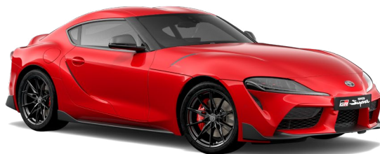
● Monza Red D05