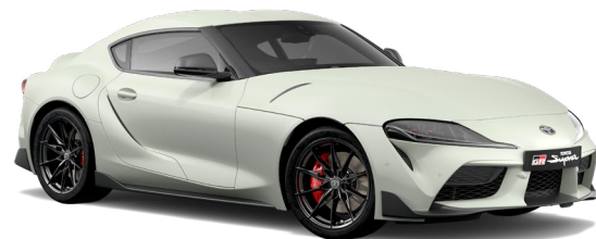
○ Matte White 4 D12