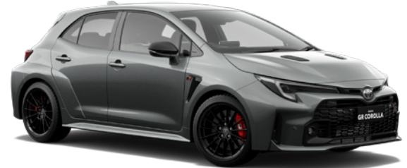
● Liquid Mercury 13 1L5