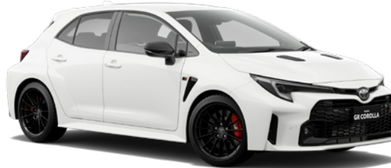
○ Glacier White 040

Choose your colour for GR Corolla and make your mark on the road. From simple white to bold statements in style, you're sure to find one to match your desire for thrilling performance on any road, every day.