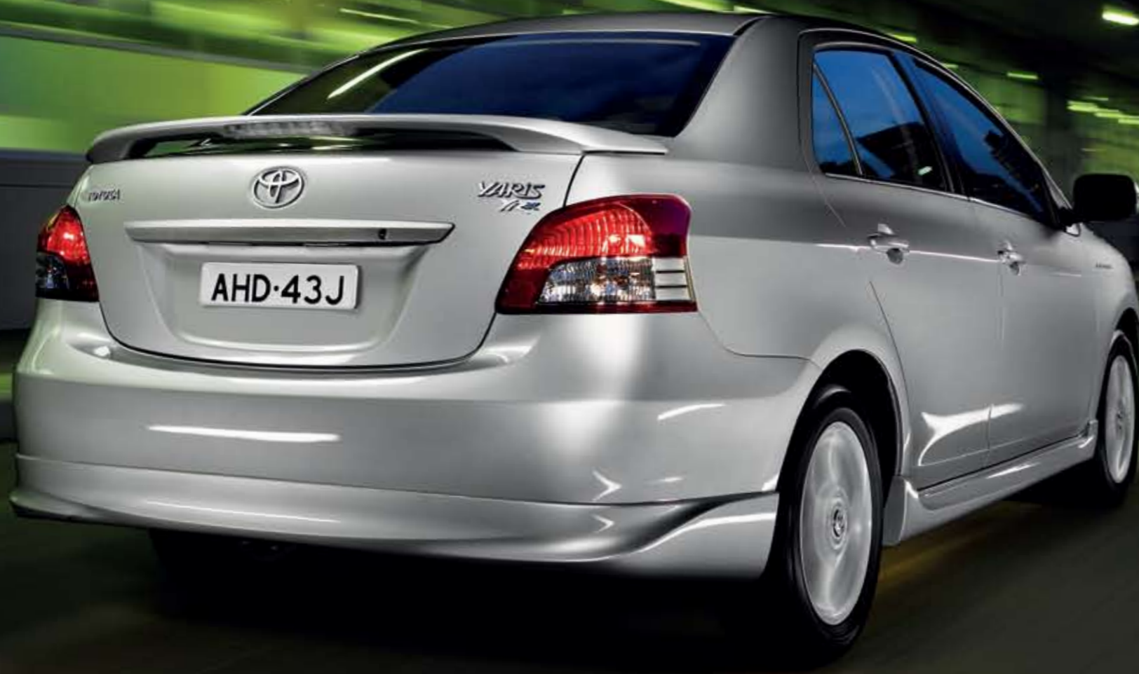
YRX model shown in Quicksilver