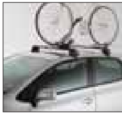
Pro Ride Bicycle Carrier