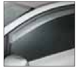
Front Weathershields (sold separately)