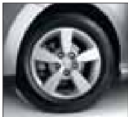
15" x 6.5" Atlas Alloy Wheel Available for Ascent only