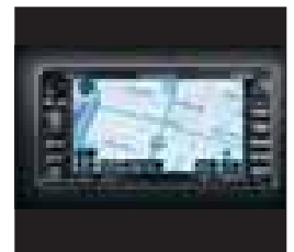
Satellite Navigation Audio System † Includes 6 in-dash MP3 / CD Changer & Radio with Bluetooth ™ Handsfree Communications & (optional) Auxiliary Audio Input & Rear View Camera Compatibility ‡