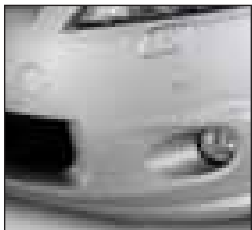
ParkAssist ® – Reverse Parking Sensors – 4 head kit & Clearance Parking Sensors – 2 head kit (sold separately)