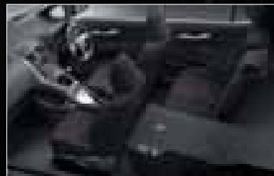
Levin ZR Hatch with 60:40 rear split