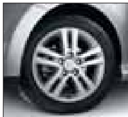
16" x 7" Raptor Alloy Wheel – Painted Finish