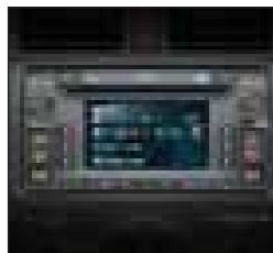
Display Audio System Includes 6-in-Dash MP3 / CD Changer & Radio with Advanced Bluetooth ™ featuring Handsfree Communications & Stereo Audio Streaming ‡ , USB / Auxiliary Audio Input / iPod ® & (optional) Rear View Camera Compatibility † Available for Ascent only