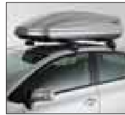
Atlantis 200 Roof Pod