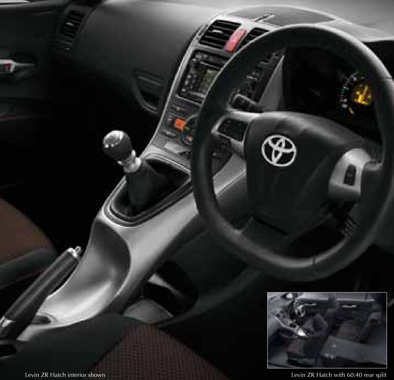
Levin ZR Hatch interior shown