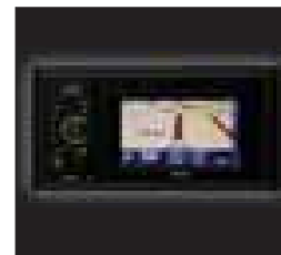
FollowMe Sound & Navigation System † Includes Bluetooth ™ Handsfree Communications, Video, USB, iPod ® , MP3 & (optional) Rear View Camera Compatibility ‡