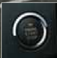
Smart Start button#