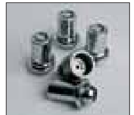
Alloy Wheel Lock Nut Set Available for Conquest, Levin SX, Levin ZR & all accessory wheels