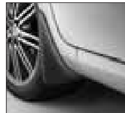
Mud Guard (set of 2) Available for Ascent & Conquest only