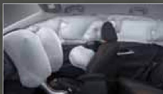
Dual front SRS airbags, front seat mounted side SRS airbag, driver's knee SRS airbag and curtain shield SRS airbag~