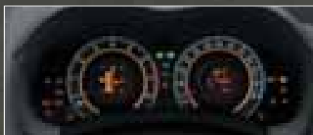
2-dial type Optitron display^