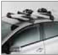
Deluxe Ski & Snowboard Carriers – 4 or 6