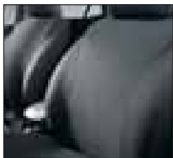
Seat Covers – Dark Grey (front & rear set sold separately) Safety warning: Fitment of Front Seat Covers which are not compatible with Front Seat Side airbags may adversely affect Front Seat Side airbag deployment & might result in serious injury