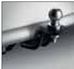
Towbar † – 1300kg (braked capacity), Towball & Trailer Wiring Harness (sold separately)