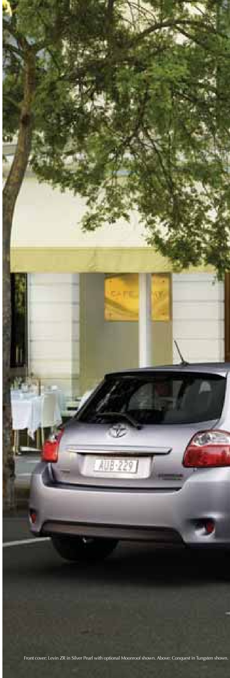
Front cover: Levin ZR in Silver Pearl with optional Moonroof shown. Above: Conquest in Tungsten shown.

† VSC and TRC standard on all models and available from October 2009 production. # Standard on Levin ZR Model. ^ Standard on Levin Models. ~ Standard on Conquest and Levin ZR Models (included in the enhanced safety pack).