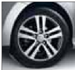
16" x 7" Raptor Alloy Wheel – Machined Finish