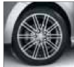
17" x 7" Kappa Alloy Wheel