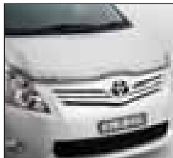
Bonnet Protector & Headlamp Covers (sold separately)