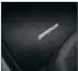
Carpet Floor Mats – Grey