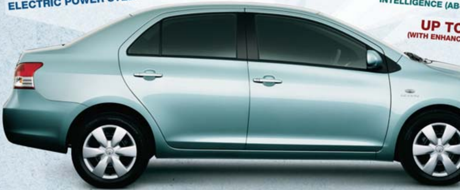
YRS model shown in Aqua Marine.