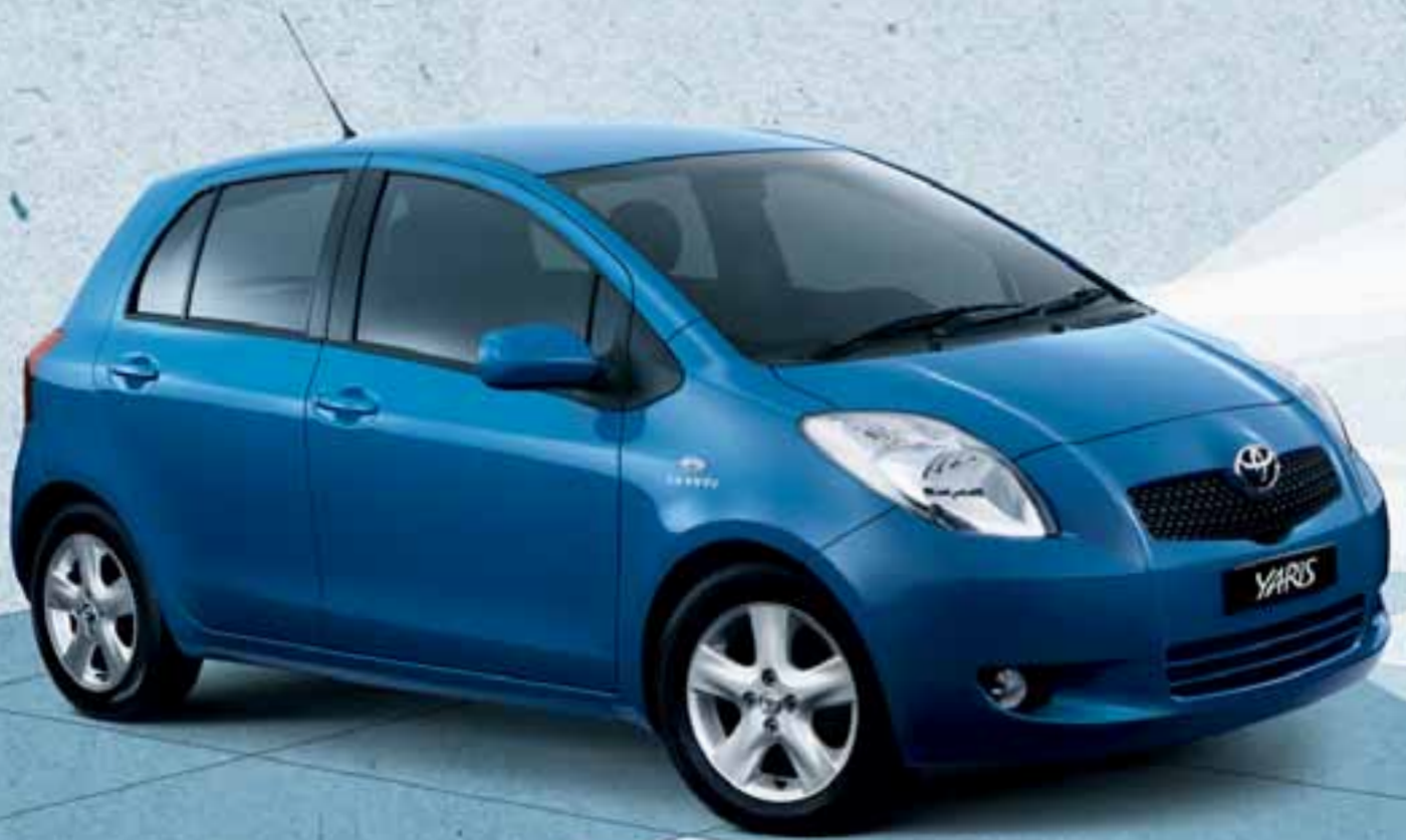
YRX model shown in Caribbean Blue